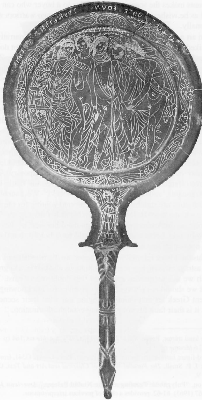
Figure 5: Rome, Villa Giulia 56135.