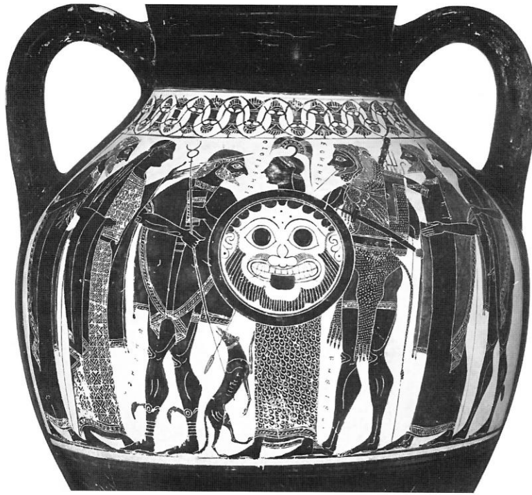
Figure 3: Basel, Antikenmuseum und Sammlung Ludwig, inv. BS 496.

indicating an Aeneas and Diomedes duel), there is a strong probability that the subject is Achilles and Memnon. 19