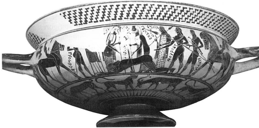
Figure 1: Basel, Antikenmuseum und Sammlung Ludwig, inv. BS 1404.

warrior and a dead Amazon; nor does he include inscriptions. 6 For Exekias the story is paramount and he wants his viewers to know precisely who is who and what is happening. Sadly not all Greek artists were as gifted as Exekias. The rest of this chapter focuses on them.